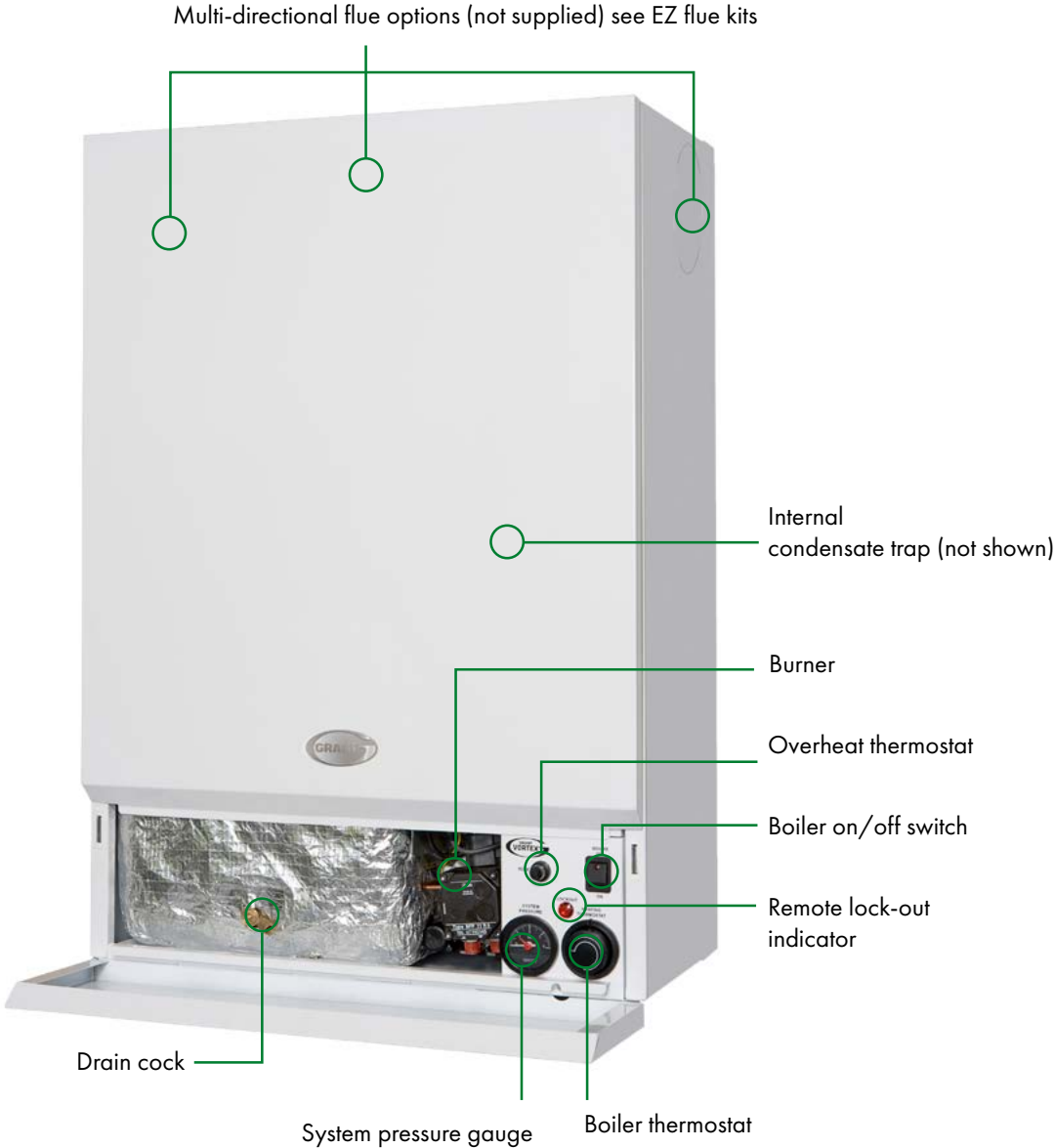
Model shown: VTXWH16/21